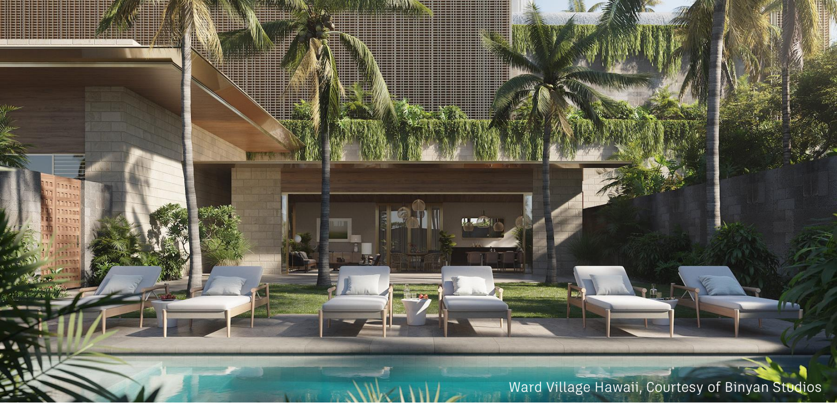
Ward Village Hawaii