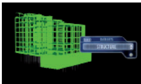
Using Autodesk® Navisworks® to work with integrated 3D models and data; reduces project risk and improves quality and productivity.