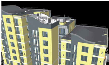
Using BIM and 3D modeling technology to visualize the challenges of the Sylvan Hill building.