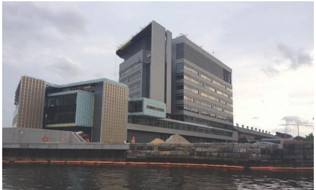
Spaulding Rehab project viewed from Charlestown Navy Yard.