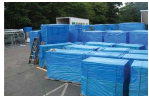
Inventory of palletised and wrapped ductwork labelled and sorted for on time delivery.