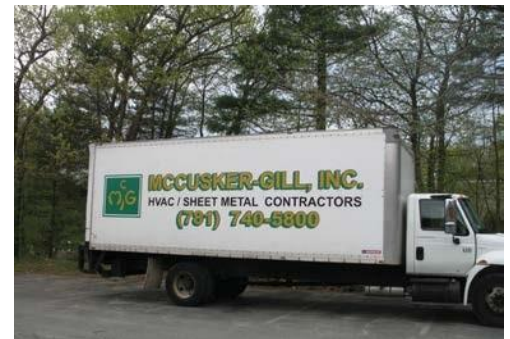
One of McCusker-Gill’s truck fleet delivers duct safely and protected from the elements.