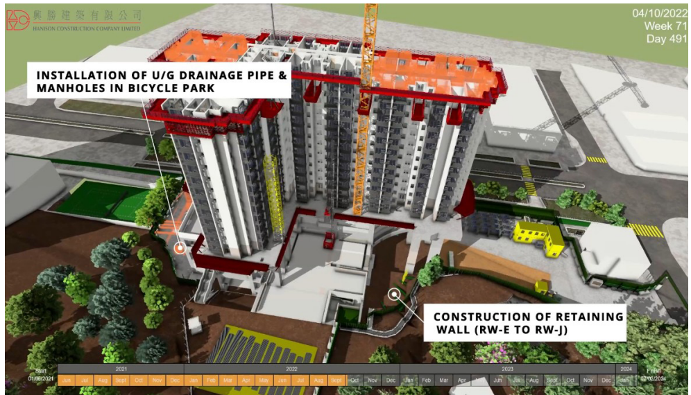
4D simulation