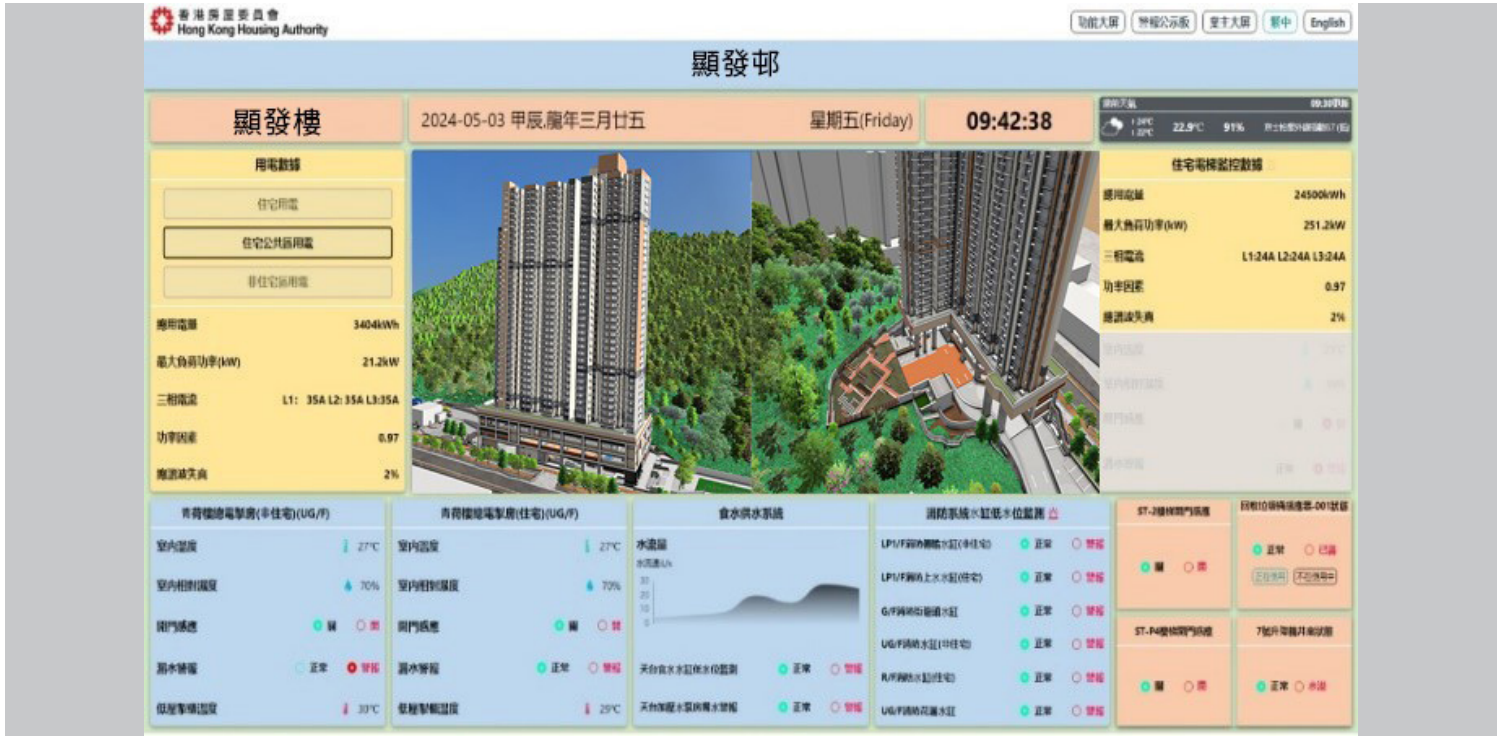
New Asset Management System for Building Maintenance and Management