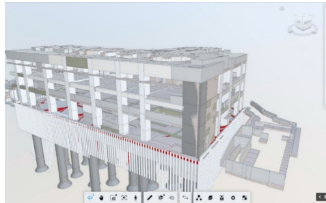
Structural Model Image