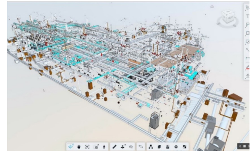
MEP Model Image