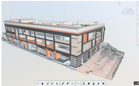
Architectural Model