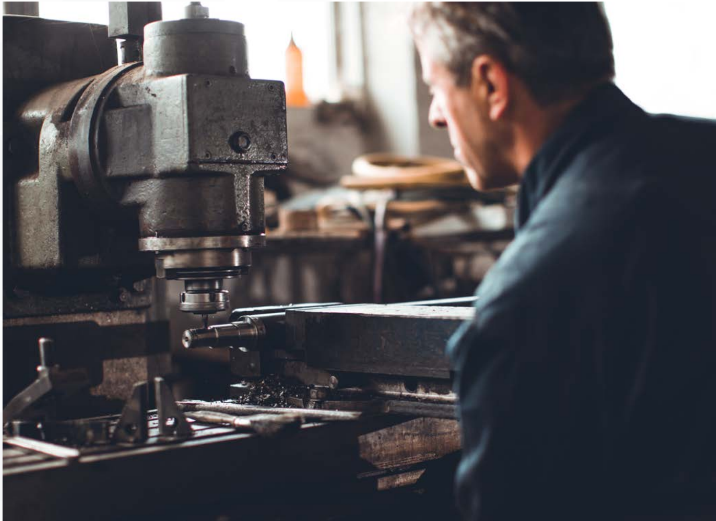
Traditional Milling Machine