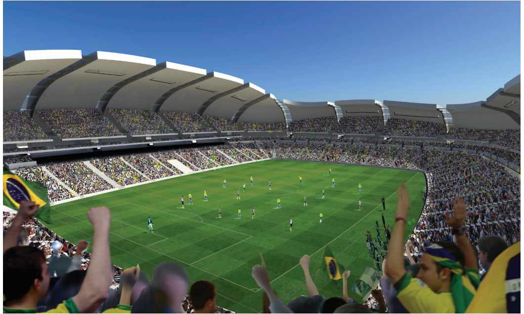
Natal Stadium