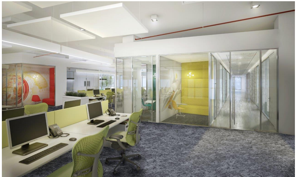
Rendering of open workstations and meeting areas.

— Agata Kurzela Head of Interiors AK Design